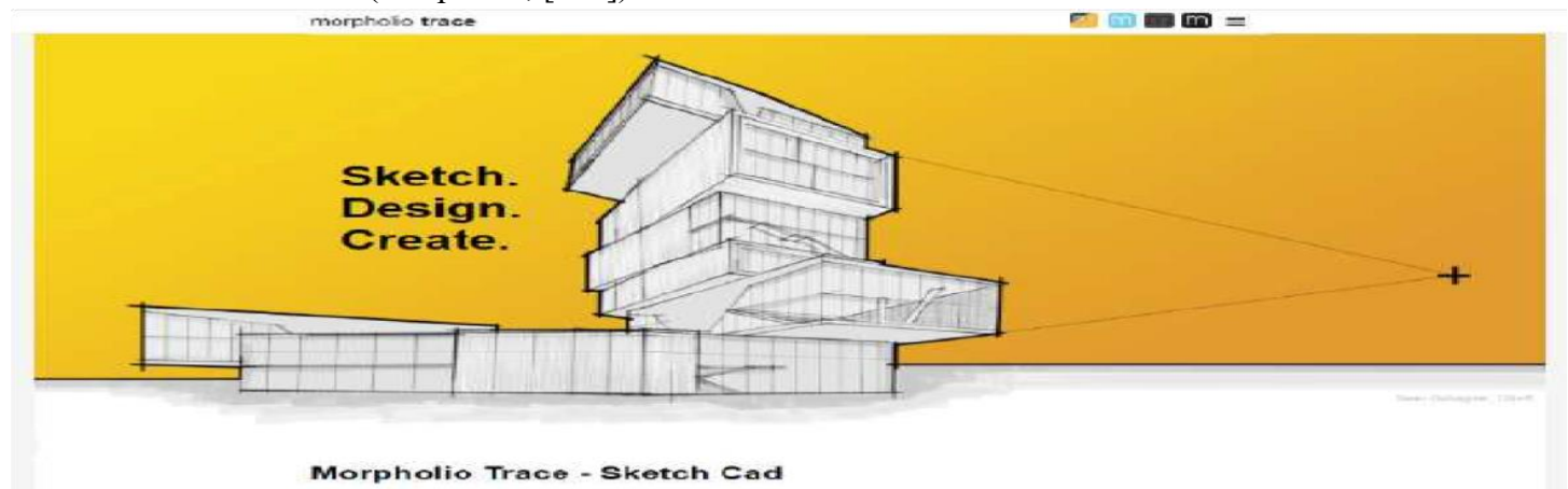
Figure 14: Morpholio Trace marketing material

Morpholio provides software that supports the creative processes used by architects, designers, artists, engineers, photographers, or any imaginative individual (Morpholio, [n.d.]). The firm was started by architect Anna Kennof and three other architects. The aim of their mobile tools is to enhance the creative design process. Being of the opinion that ‘thinking with your hands’ is a critical component of the design process, they developed applications (apps) that aid the design process, particularly for use on tablets. Users pay a subscription fee to use their products (Archipreneur, 2018: 2-3). Their flagship app is called Trace (see Figure 14). Morpholio Trace was developed for use with Apple’s iPad Pro and the Apple pencil. It replicates the process of overlaying a photograph or drawing with tracing paper and using freehand technique to develop design ideas (Archipreneur, 2018: 5). Other products are ‘Board’ and ‘Journal’ (Morpholio, [n.d.]).