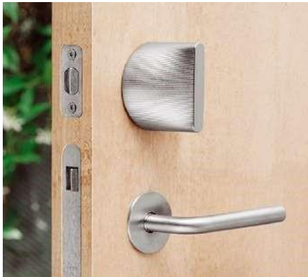
Figure 4: Friday Smart Lock

Another highly regarded architectural practice, Bjarke Ingels, has expanded its expertise to include product design and creation (Archipreneur, 2015a: 2). In 2014, the group started the BIG Ideas unit with the intention of broadening the scope of work undertaken by the practice (Archipreneur, 2015b: 1). Its website claims that “we have explored personal technology, urban mobility and furniture. With BIG Ideas we feel we can close the gap and really make our interest in product design a literal extension of our efforts in architecture. The Friday Smart Lock is the latest product developed in partnership with Friday Home” (BIG ideas, [n.d.]) (see Figure 4).