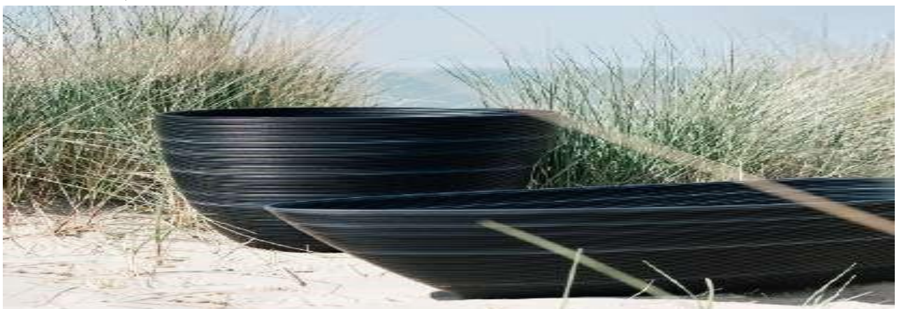
Figure 13: 3D-printed planters designed by House of DUS