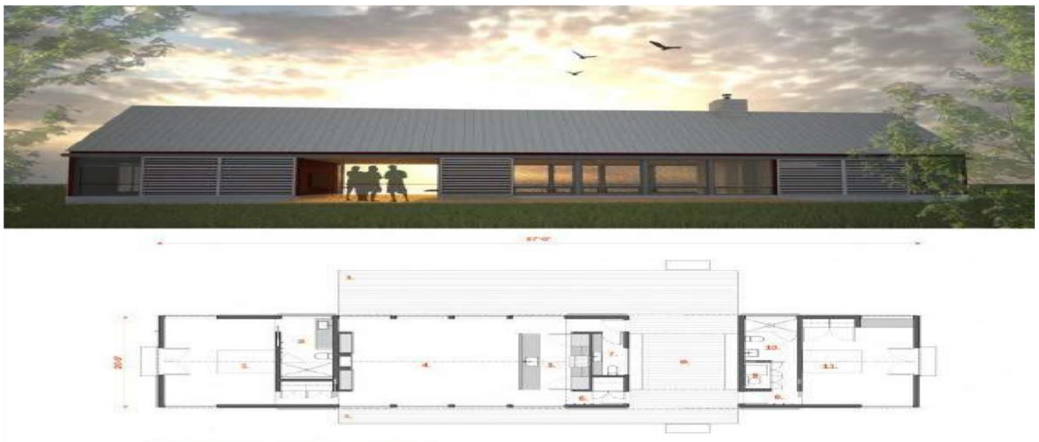
Figure 12: Productised Longhouse plan and elevation by Eric Reinholdt