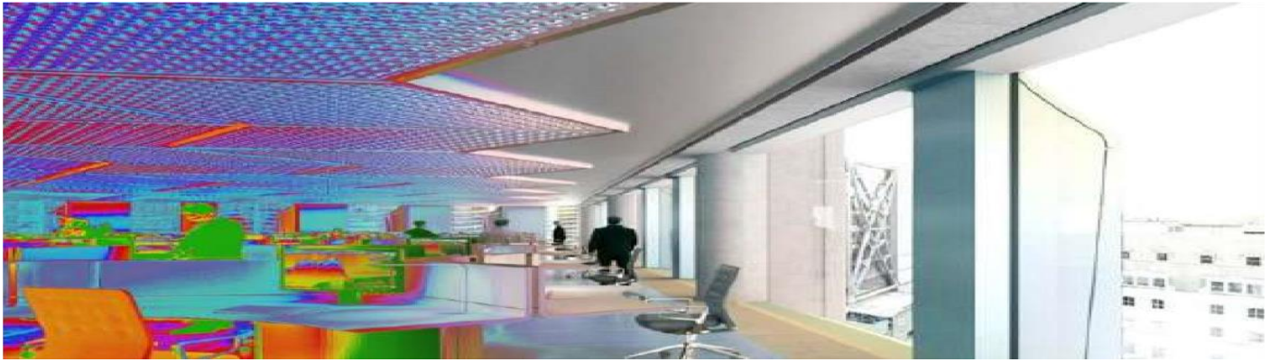
Figure 3: Analysis of light, heat, air, and sound movement through a building