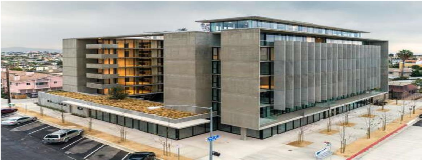
Figure 8: Park and Polk, San Diego (2018).