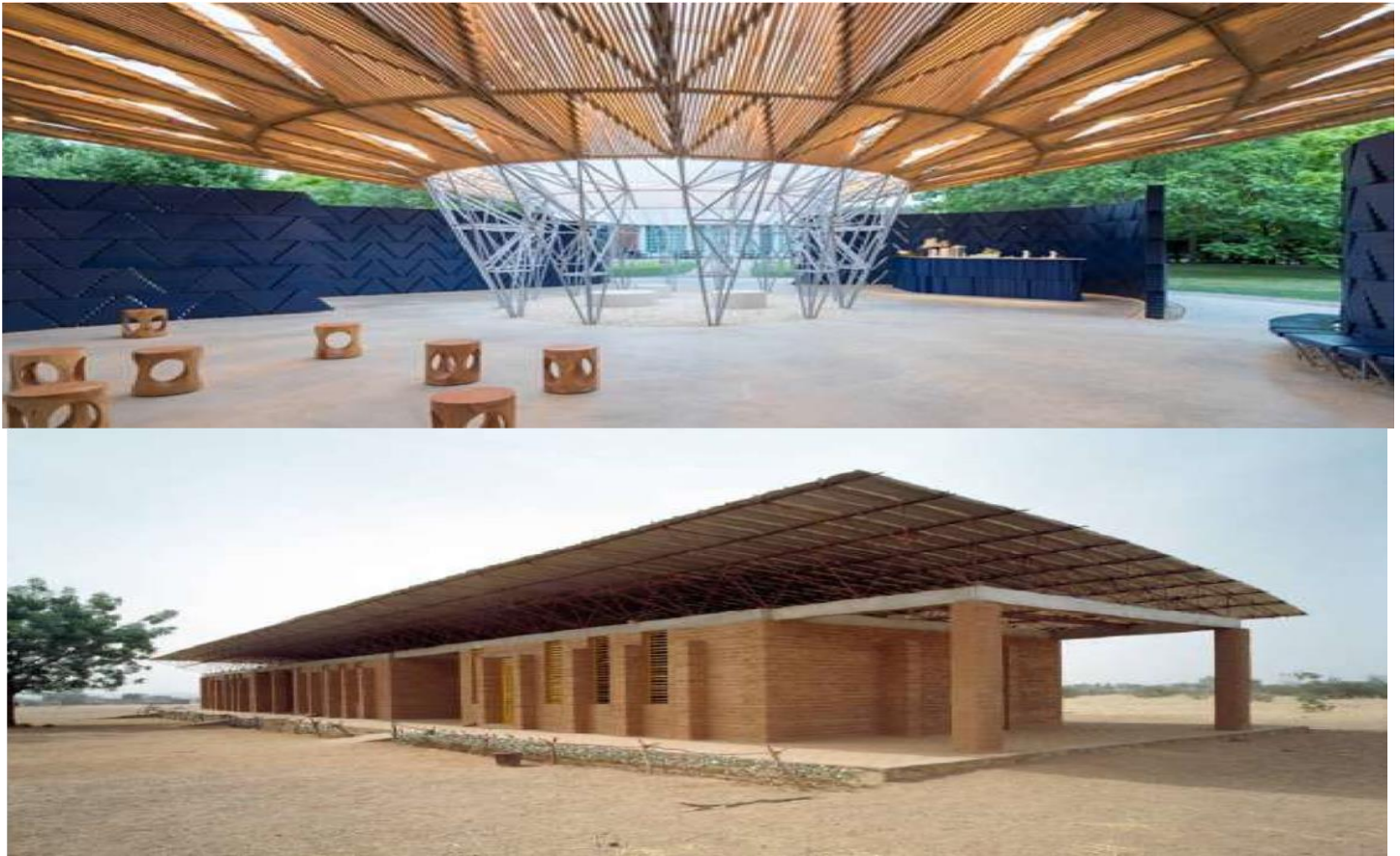
Figure 9: Ziba Stools at the Serpentine Pavilion.