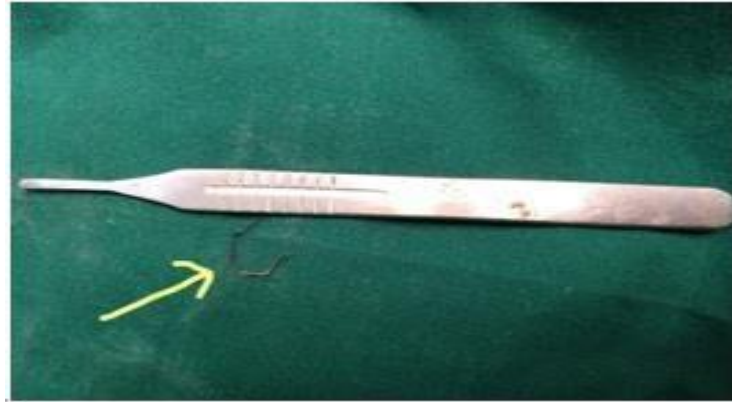
Fig 2. Stapler pin retrieved from ileocaecocolic junction

fluids. Inj. Amoxicillin Sulbactam at a dose rate of 10mg/kg bodyweight, inj. Ranitidine at a dose rate of 0.5mg/kg bodyweight and Vitamin B complex were administered for five days. Sutures were removed on the ninth postoperative day. Pup had an uneventful recovery