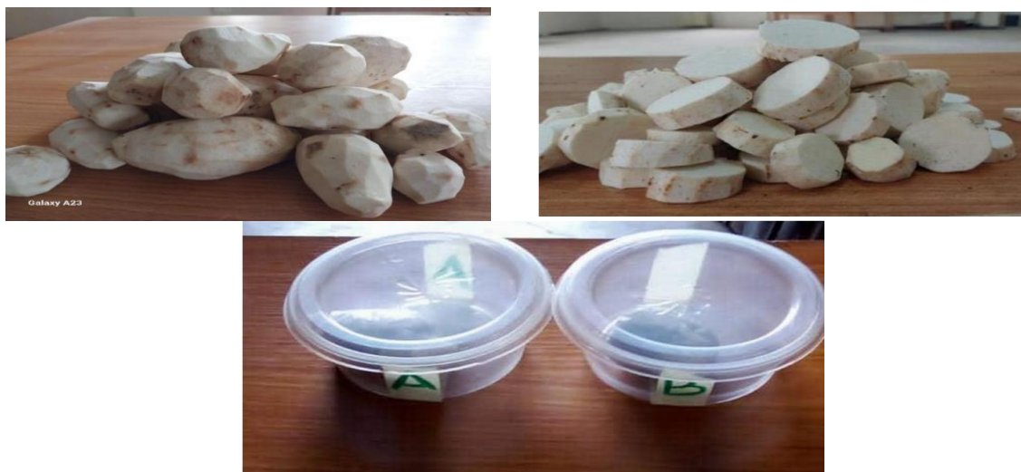
Figure 1 : Pictorial description of processing stages of cocoyam flour

sieved through a standard laboratory sieve of 500-micron meter aperture to produce uniform particle size flour, packaged in polythene bags, sealed and then stored in air tight containers with appropriate label (A & B) and then carried to the laboratory where the samples were investigated. The sample preparation stages are shown in figure 1.