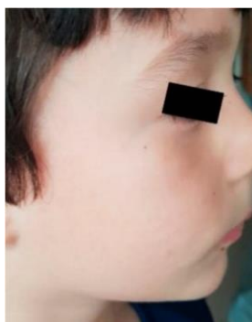
Fig. 7 – 1 year later