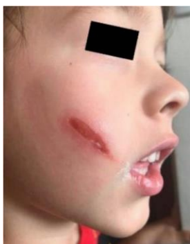
Fig. 5 – accident day