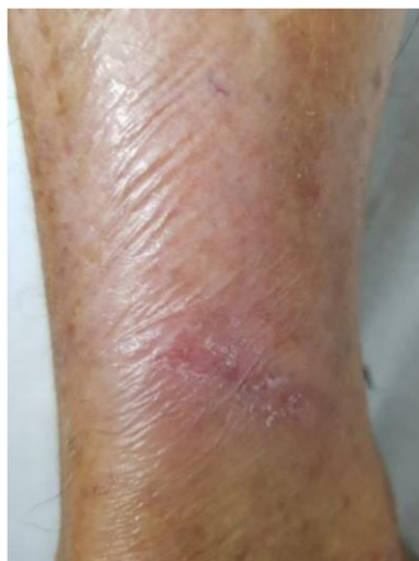
Fig. 8 – 1 st day of service Fig. 9 – 28 th day of service