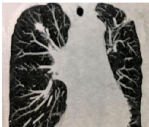
Fig. 1 – 1 st meeting – Front CT without contrast