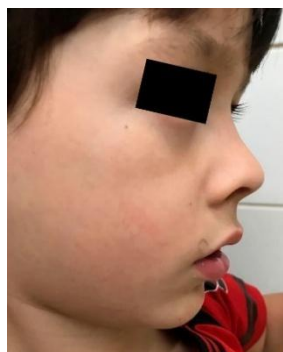
Fig. 6 – 1 month later