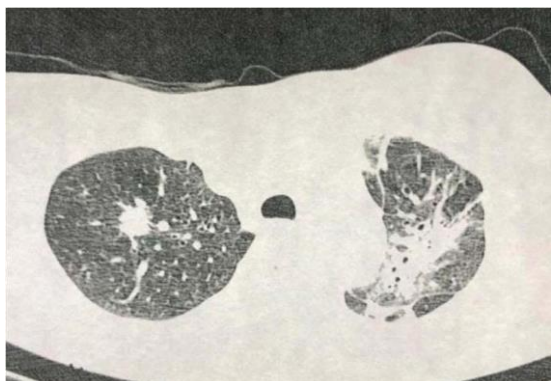
Fig. 3 - 1 st meeting – Sagittal Tomography without contrast