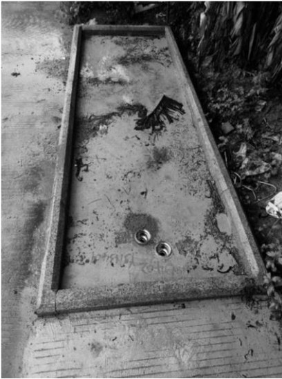
Figure 2: Renderings of the garbage collection point renovation

Two stainless steel sealable and openable floor drains are set on the hardened ground of the garbage collection point, one for collecting rainwater and the other for collecting rainwater. On sunny days, the floor drain for collecting sewage is opened, and the floor drain for collecting rainwater is closed. At this time, the sewage discharged from the garbage point is mainly collected. When it rains, the floor drain for collecting rainwater is opened, and the floor drain for collecting sewage is closed. At this time, the main collection is the rainwater during the rainfall. The specific effect is shown in Figure 2.