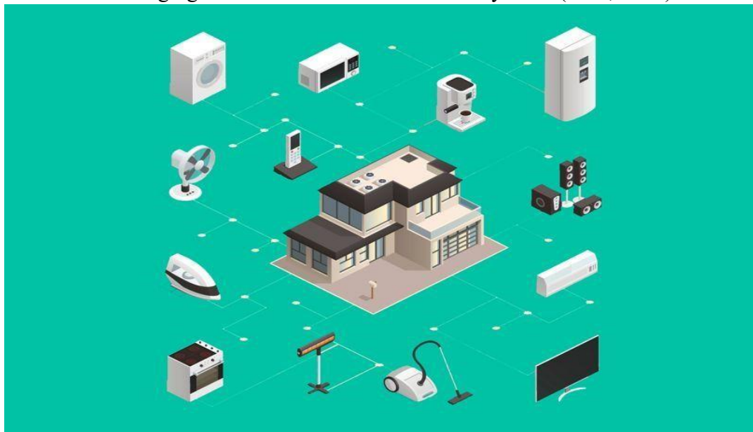
Fig. 1: Diagram depicting Internet of Things (IoT).

Smart Phones, smart toasters, connected rectal thermometers and fitness collars for dogs are presently several of the everyday items being connected to the web as component of the Internet of Things (IoT). Connected devices and objects in industries present the prospect for a “fourth industrial revolution”, and experts forecast that more than half of emerging businesses will run on the IoT by 2020 (Matt, 2018).