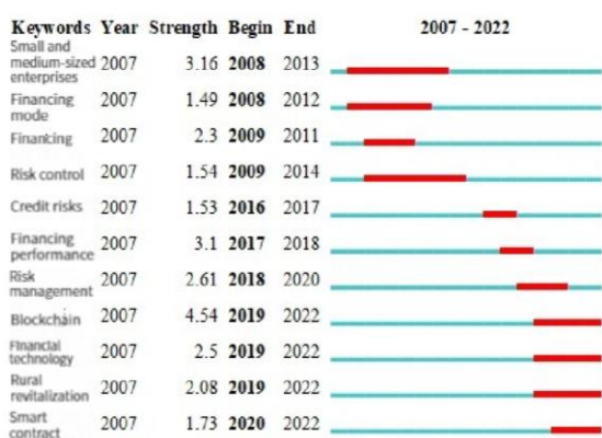
Figure 4 Abrupt evolution map of keywords in the research field of supply chain finance in CNKI database during 2007-2022