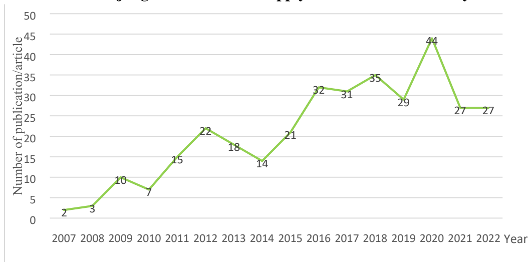
Figure 1 Trend analysis of the number of papers published in the field of supply chain finance in China from 2007 to 2022

The number of literature output can reflect the research progress in this field to a certain extent. Based on this, Figure 1 shows the output time distribution of supply chain finance literature from 2007 to 2022. On the whole, the relevant research results in the field of supply chain finance show a steady upward trend. The theoretical research process can be specifically divided into four stages: embryonic period (2007-2010), preliminary