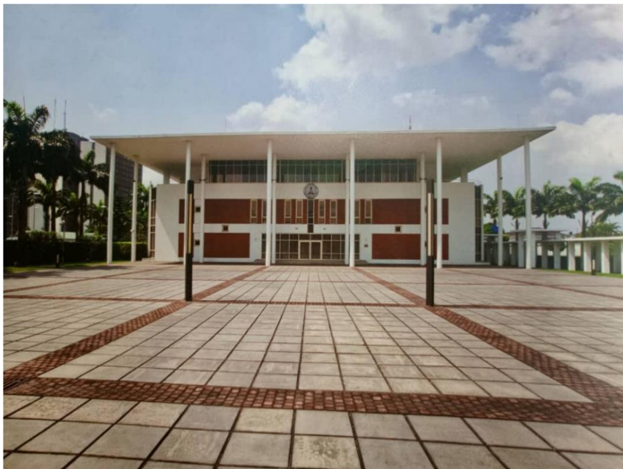
Plate 4. Rivers State Government House (Brick House) in Port Harcourt Commissioned in 2005