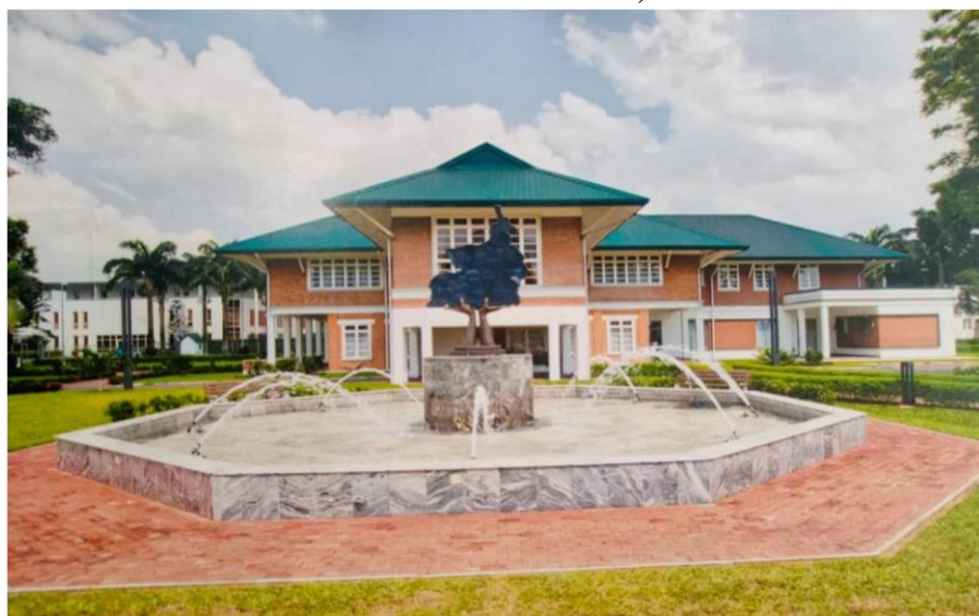
Plate 3. Rivers State Government House (Brick House) in Port Harcourt Built in 1928