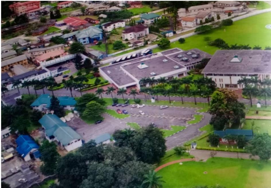
Plate 6. Aerial view of a segment of the Rivers State Government House, Port Harcourt (2005)