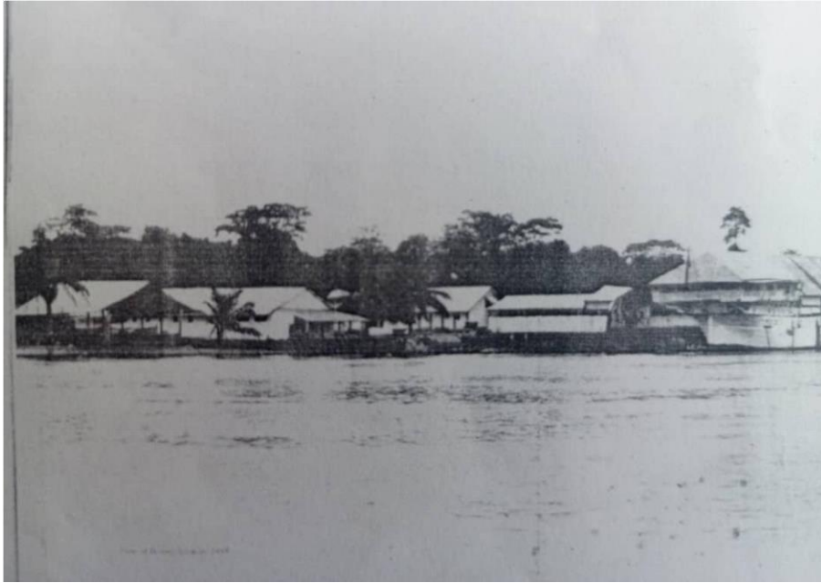
Plate 1. The Hulk Housing the Consular Building, George Shotton on Bonny River in 1884 (First Administrative Building)