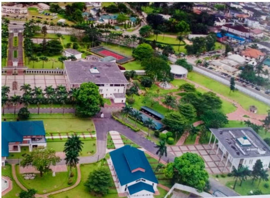
Plate 5. Aerial view of a segment of the Rivers State Government House, Port Harcourt (2005)