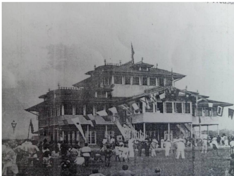
Plate 2 The New Bonny Consulate Building in Bonny Island Built in 1899