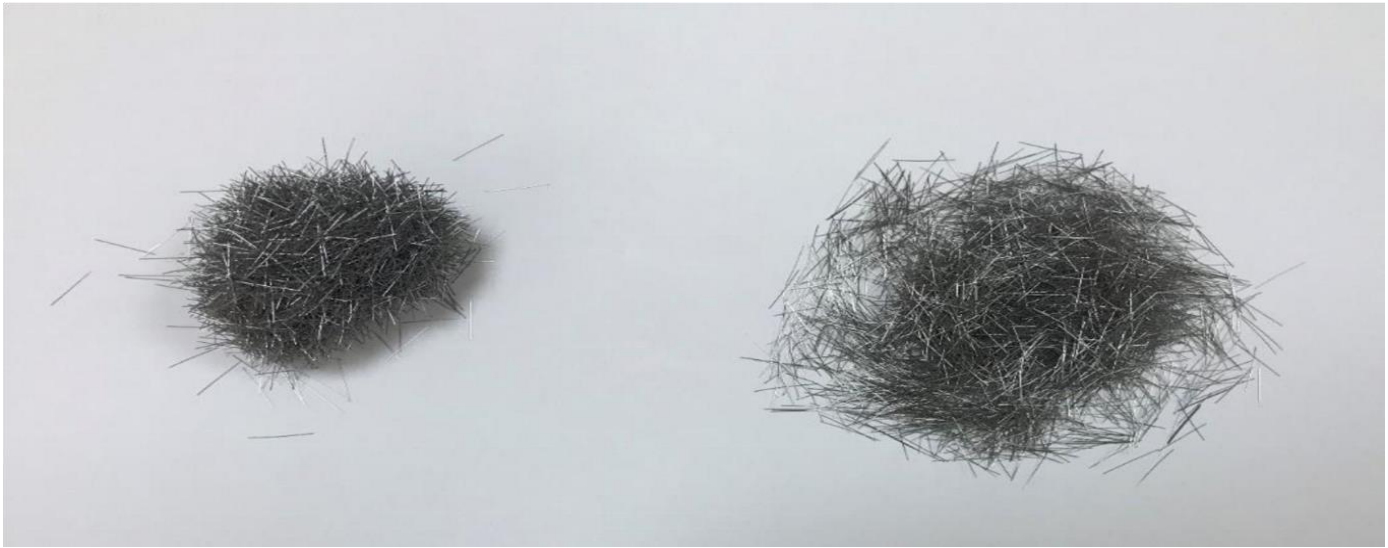
Figure 1. Images of problematic and suitable steel fibres

Figure 2. SEM-EDS analysis results of suitable steel fibres; a) 500x, b) 1000x, c) EDS spectra Figure 3. SEM-EDS analysis results of problematic steel fibres; a) 500x, b) 1000x, c) EDS spectra