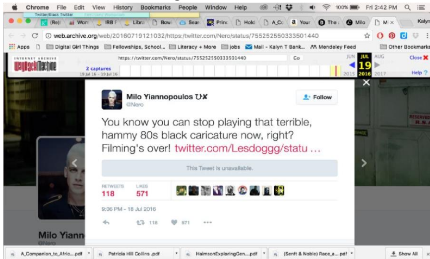
Figure 1 Archived Tweet of Milo Yiannopoulos, 2016

Actor and comedian Leslie Jones experienced trolling, on July 19 th 2016, after the release of the remake of the fan-fiction movie Ghostbusters this summer. Leslie Jones attacker, Milo Yiannopoulos, began his trolling against Leslie Jones by stating his disdain for the remake of Ghostbusters and her role in the movie as seen below in Figure 1 and Figure 2. (Archived Tweet of Milo Yiannopoulos, 2016) After his remarks were made online other racist trolls began to fill Jones’ mentions on Twitter with lewd, cruel, and racist remarks.