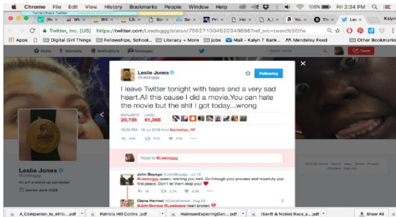
Figure 3 Archived Tweet of Leslie Jones, 2016

The hashtag #LoveForLeslieJ was created on Twitter where people posted positive remarks using the hashtag in order to pad Jones' mentions with positive words in order to help redirect the hateful comments she was receiving. Paul Feig, director of Ghostbusters , was the first to start the trending hashtag in support of protecting Leslie Jones as seen below in Figure 4 (Archived Tweet of Paul Feig, 2016).